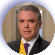
Iván DUQUE MÁRQUEZ