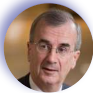
François VILLEROY DE GALHAU