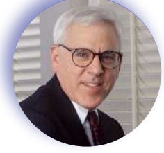
David M. RUBENSTEIN

Co-Founder and Co-CEO, The Carlyle Group